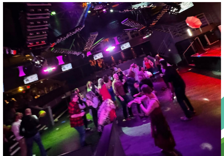
A look at the venue