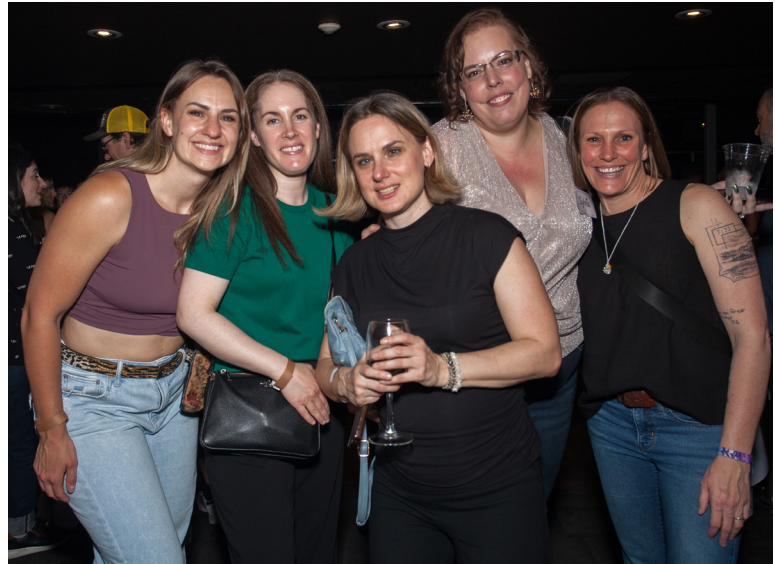
Grads from the Classes of 2000 and 2004