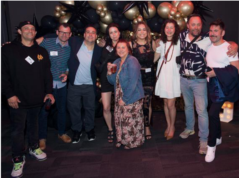
Grads from the Classes of 2000 and 1998