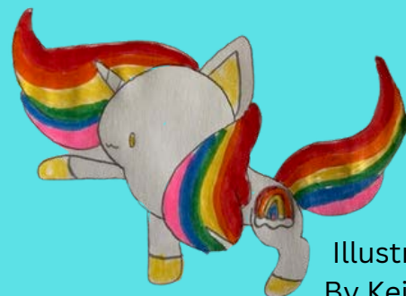
Illustration By Keiyanne