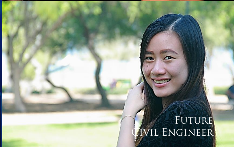
FUTURE CIVIL ENGINEER