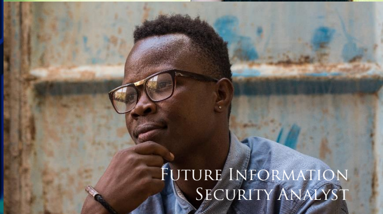
FUTURE INFORMATION SECURITY ANALYST