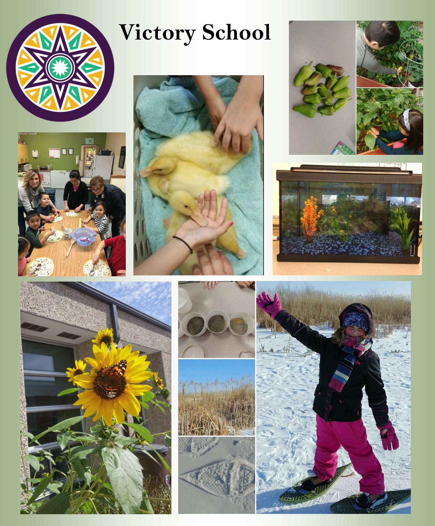
"We do not inherit the earth from our ancestors, we borrow it from our children." – Native American Proverb