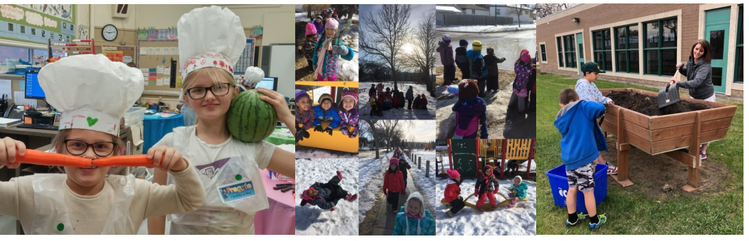
"Time in nature is not leisure time; it's an essential investment in our children's health."