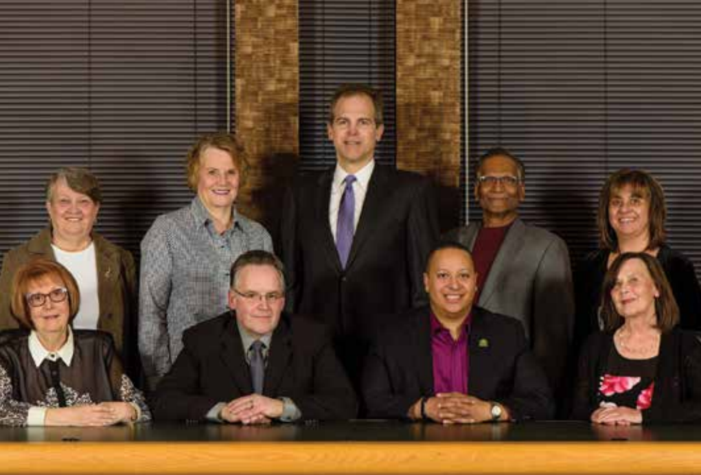
Seven Oaks School Division Board of Trustees