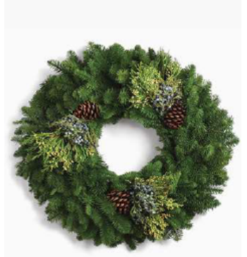
2 OPTIONS AVAILABLE

PICK UP AT ORGANIZATION Fragrant, fresh and finished with a bow! Complete with pine cones, this mixed greens wreath is perfect for decorating your front door or to hang anywhere outdoors. The wreath form is 14" and outer diameter of greens is approximately 23".