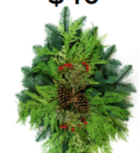
2 OPTIONS AVAILABLE

Purchase a Poinsettia Voucher and choose your own from our large selection of colours and varieties. Redeem in store before December 23, 2024.