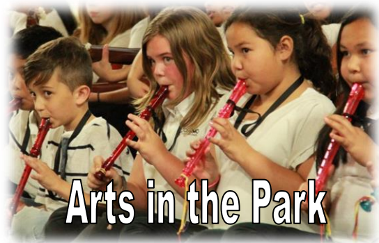
Arts in the Park