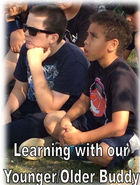
Learning with our Younger/Older Buddy