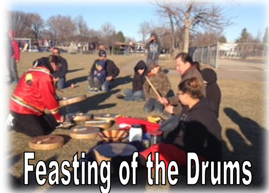
Feasting of the Drums