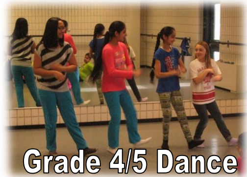
Grade 4/5 Dance