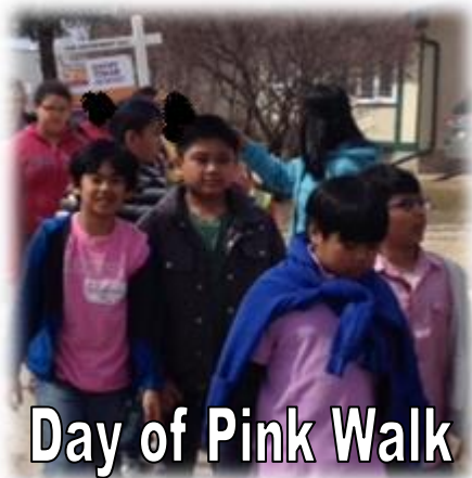
Day of Pink Walk