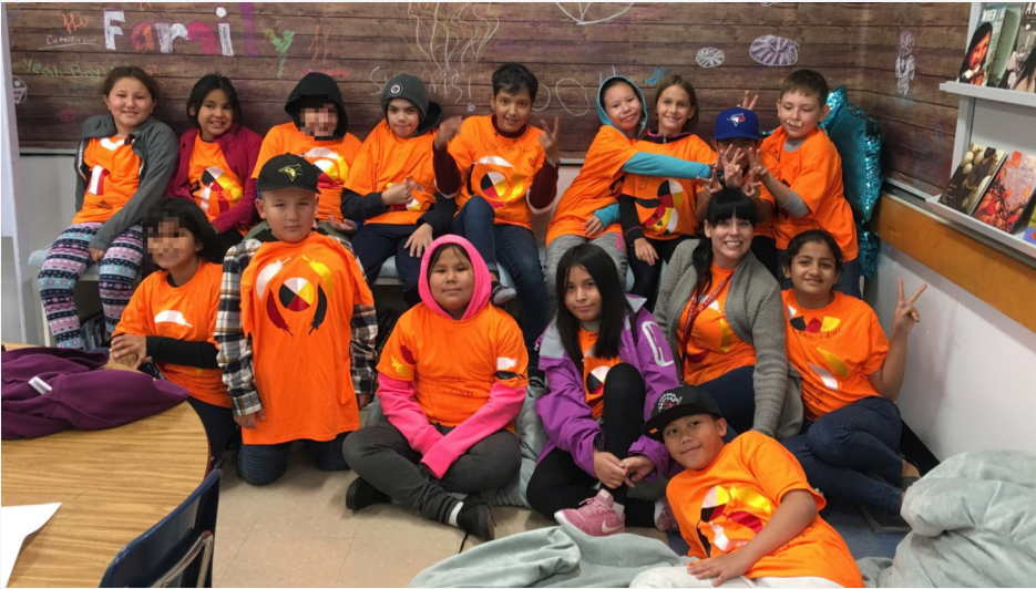
Room 13 recognizing Orange Shirt Day!