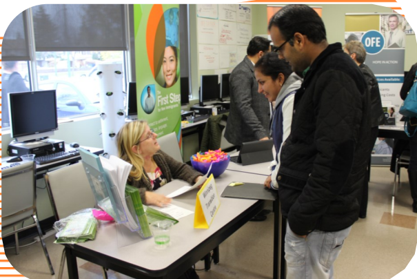
Job Fair 2014