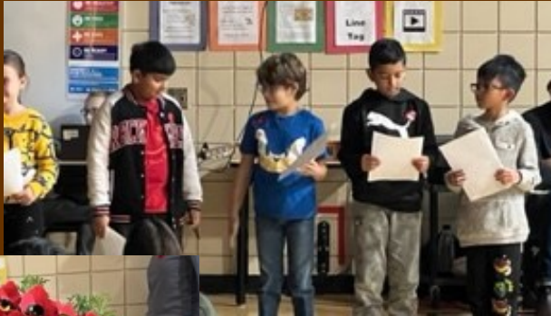
Remembrance Day School Assembly