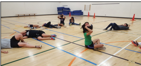
Exhausted after hard work at practice.

7/8 Girls Volleyball Coaches Sreen Conner Ciara Ziegler Reanne Cairns