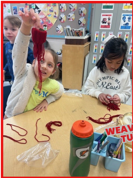
WEAVING MINI TUQUES!