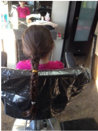
This braid is 10 inches of hair.