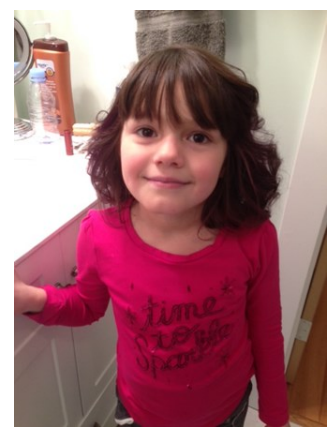
My new hair!