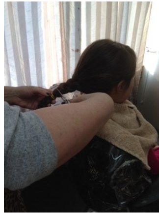
Cutting off 10 inches of hair.