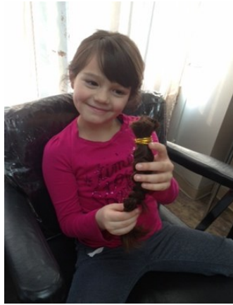
Holding my braid.