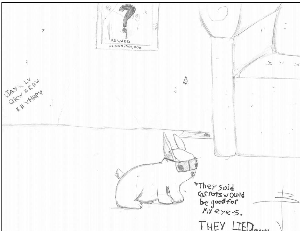
Original artist's sketch