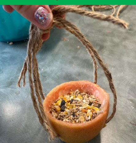
Check out our compostable bird feeders in our yards!