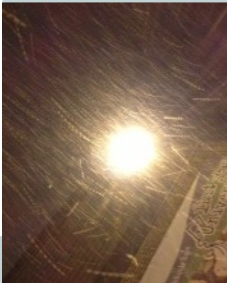
She gently tugged at my coat sleeve.

It was dark, cold and blustery, while I waited for the last of the parents to pick up their children. I was on automatic pilot, going through the motions of adulthood at the end of a long day. It was at this precise moment that I felt a light tug on my coat sleeve. Assuming the worst, I asked what was