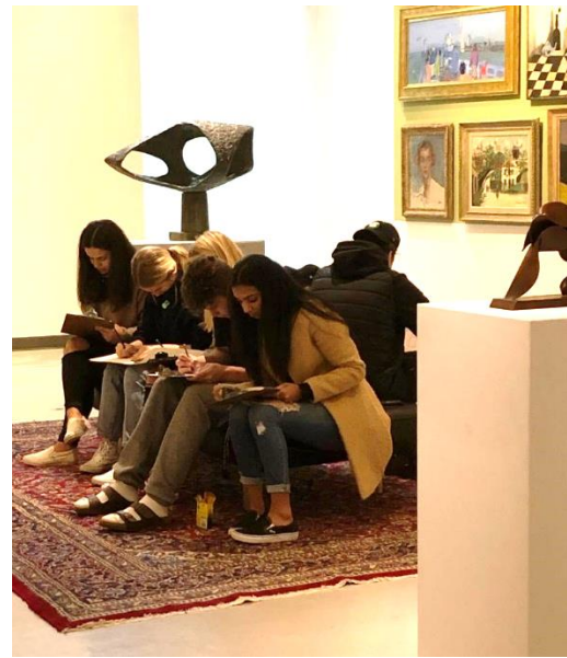
Visiting the Kent Monkman exhibit and 'salon style' permanent collection at the WAG