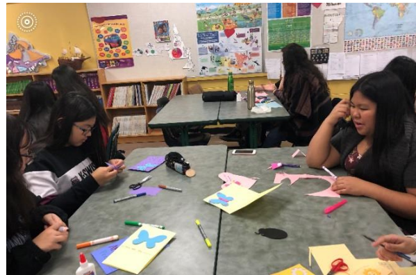
Winnipeg Harvest Breakfast to Go Program - notes of affirmation