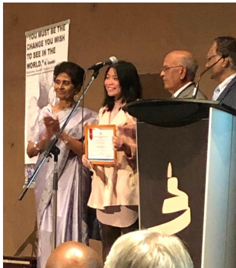
Gandhi 150 Essay Competition