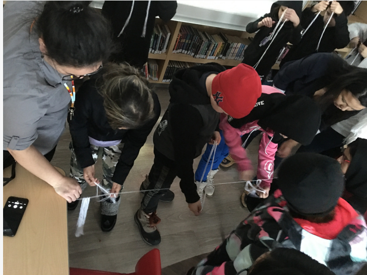
Students in Pow Wow Club learning how to make regalia.