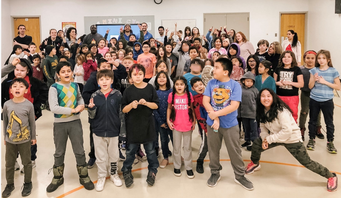
Grade 1/2/3 students were visited by Winnipeg Blue Bomber players for Bell Let's Talk Day!