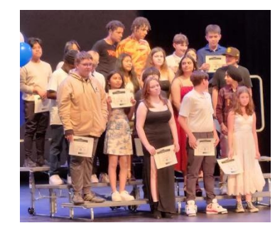
Classroom, Athletics, and Music achievements to be proud of!