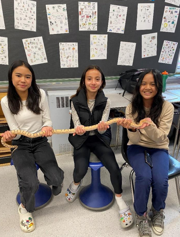
Prairie Exotics visits 6 Kirton