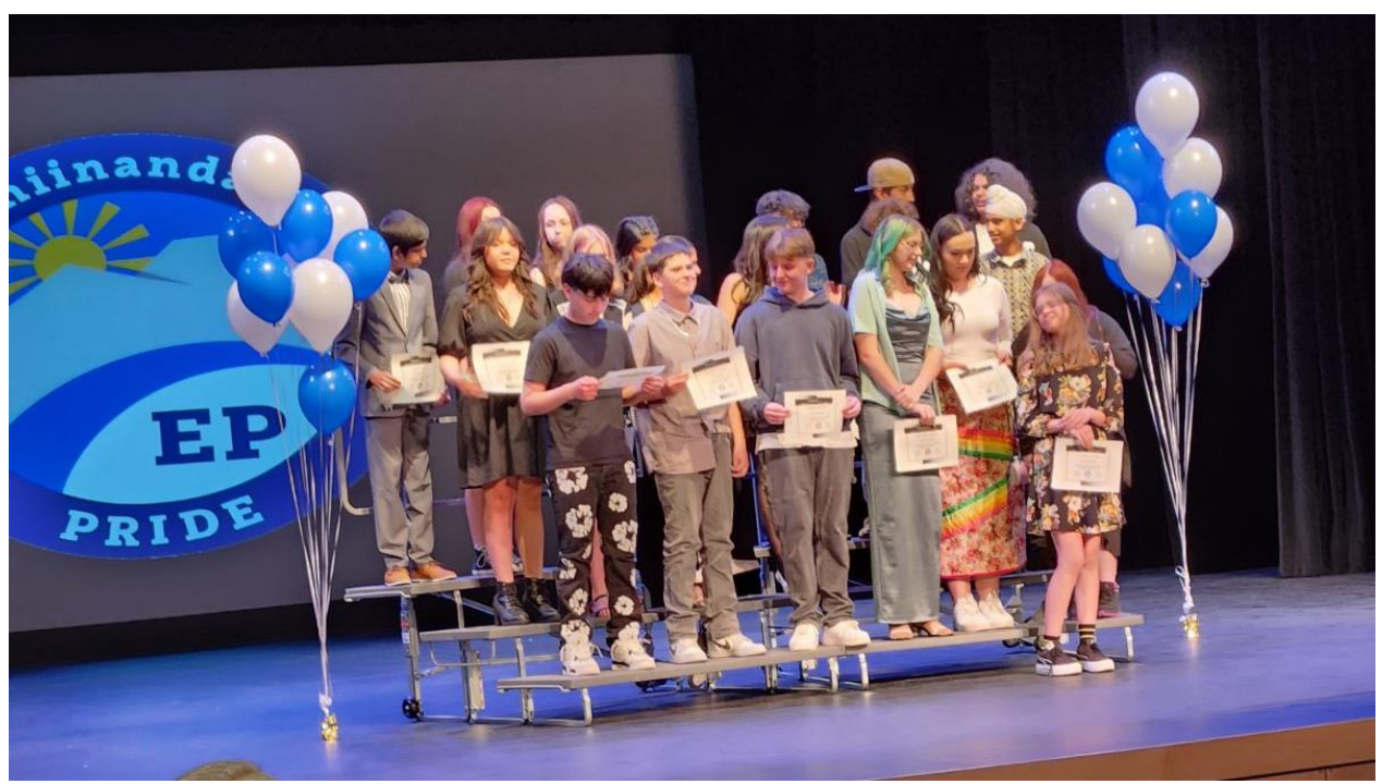
Proud Grade 8 Classes of 2024