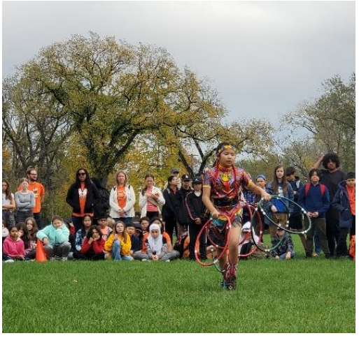
Orange Shirt Day at Kildonan Park