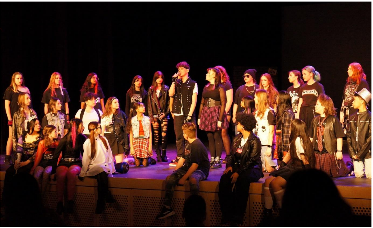
We Will Rock You Musical Production