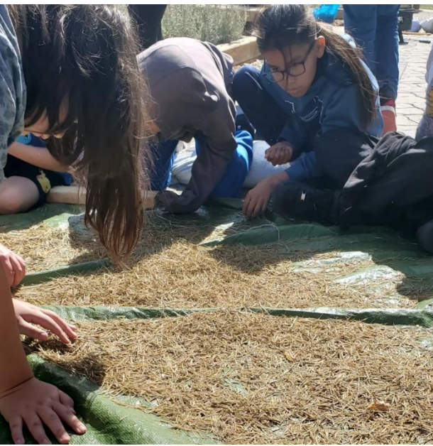
Manoomin! Anishinaabe students harvesting wild rice.