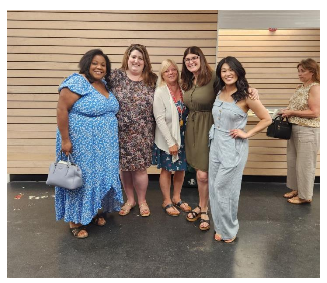
What a Team!