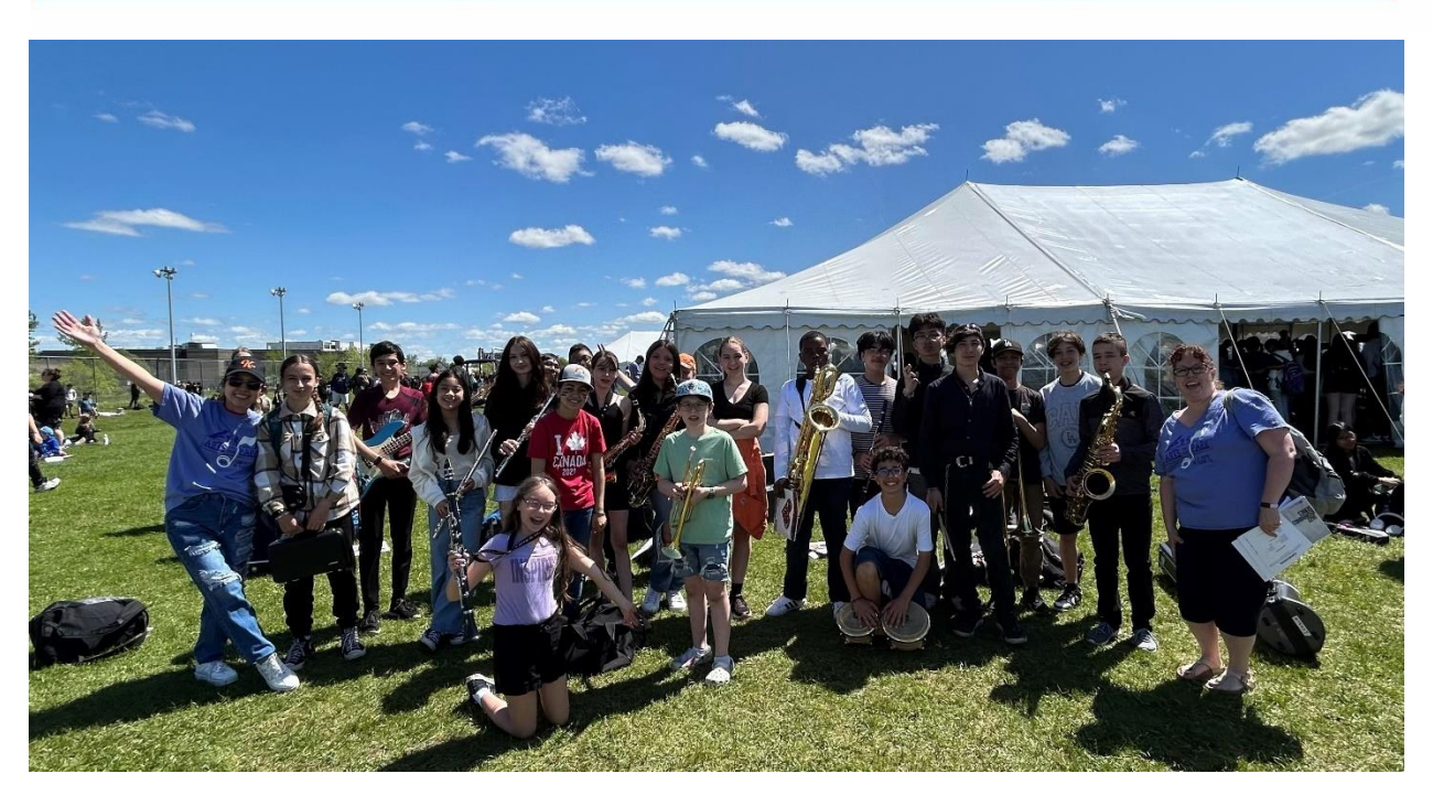
Jazz Band at Arts in the Park

"This year, one of the highlights for the grade 8 students of Room 129 was winning the grade 8 class wars! Together, they worked hard and secured victory by dominating in events such as blind bean bag toss, relay cup stacking, and tug of war.