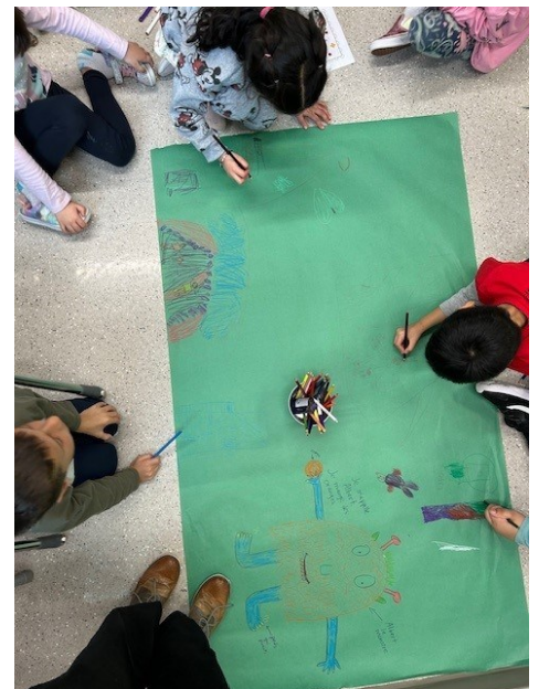
Grade 1 Art Club

just to name a few! We were so glad to see how engaged our students were to try a new activity!