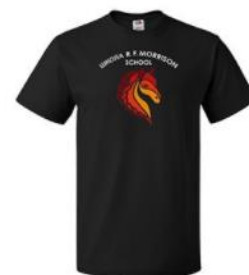
RFM SHORT SLEEVE TEE