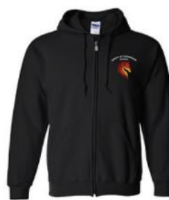
RFM ADULT FULL ZIP HOODIE