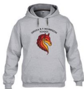
RFM ADULT PULLOVER HOODIE