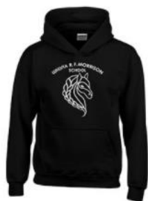
RFM YOUTH PULLOVER HOODIE