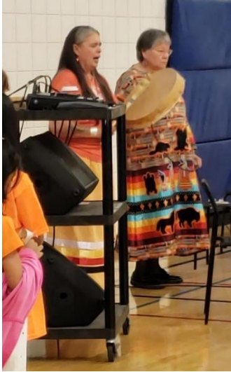
National Day of Truth and Reconciliation. Family members shared a traditional drum song and teachings.