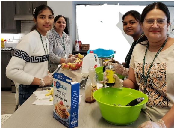
Family and community volunteers were a tremendous support in preparing a nutritious breakfast snack for all kids twice a week!