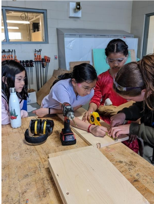
Room 17 collaboration with Garden City TAA students.

Character is cultivated by concern for others so that the child can say, "I have a purpose for my life."