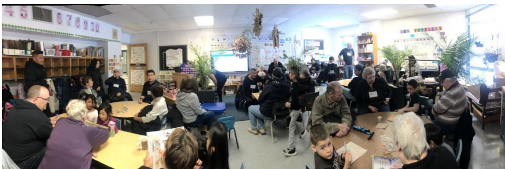
Books and Bannock- inviting grandparents in to celebrate literacy for I love to read month!

We welcomed families to join us for our Finney Community BBQ in September. A beautiful evening of celebration and connection.