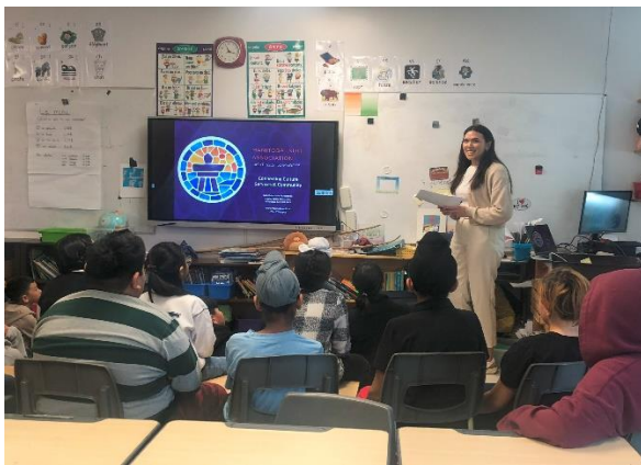
Rooms 12 and 8 invited guest speakers from the Manitoba Inuit Association to support our learning about Canada's North.