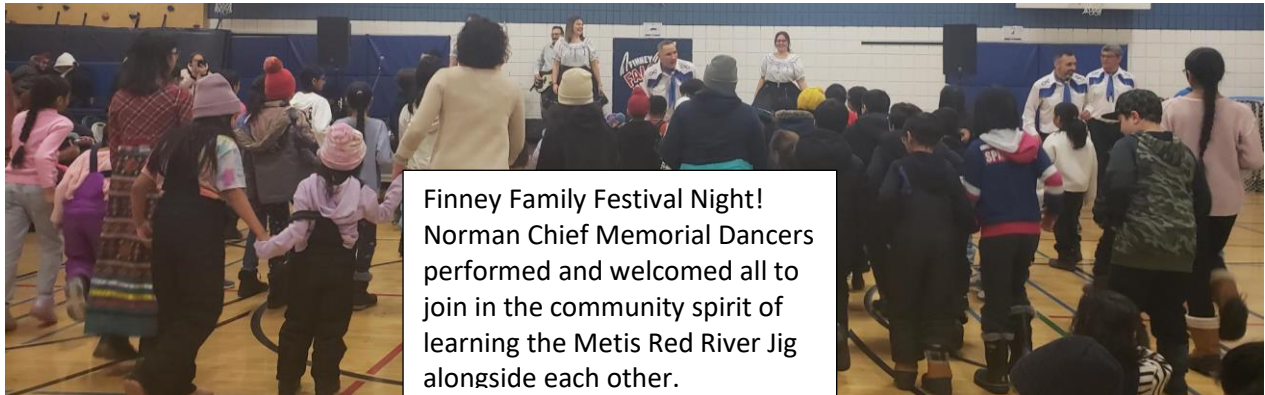
Finney Family Festival Night! Norman Chief Memorial Dancers performed and welcomed all to join in the community spirit of learning the Metis Red River Jig alongside each other.

The universal longing for human bonds is cultivated by relationships of trust so that the child can say, "I am loved."