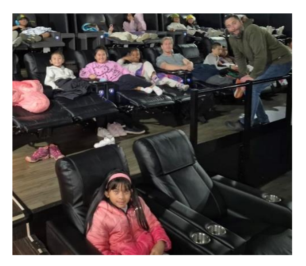
French Immersion field trip to a movie theatre to enjoy a movie in French. Several classes took part, creating a very memorable, meaningful, and educational experience of belonging.