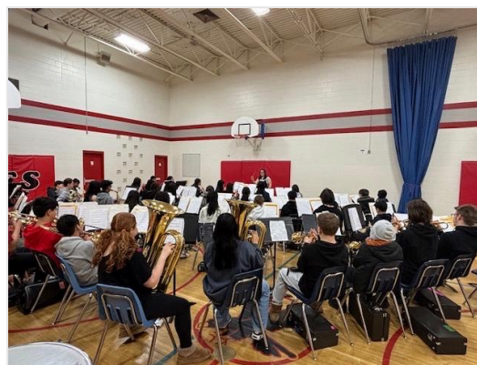
Clubs at H.C. Avery