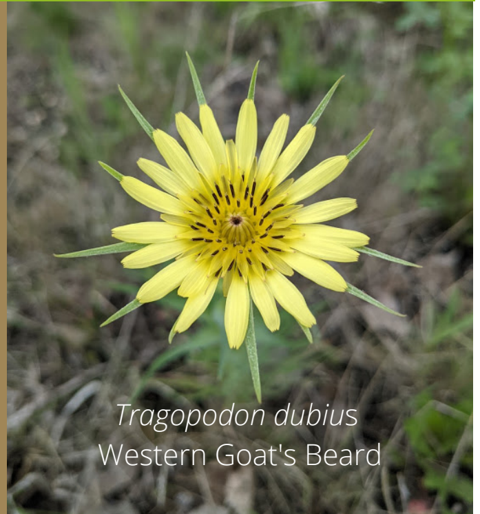
Tragopodon dubius Western Goat's Beard