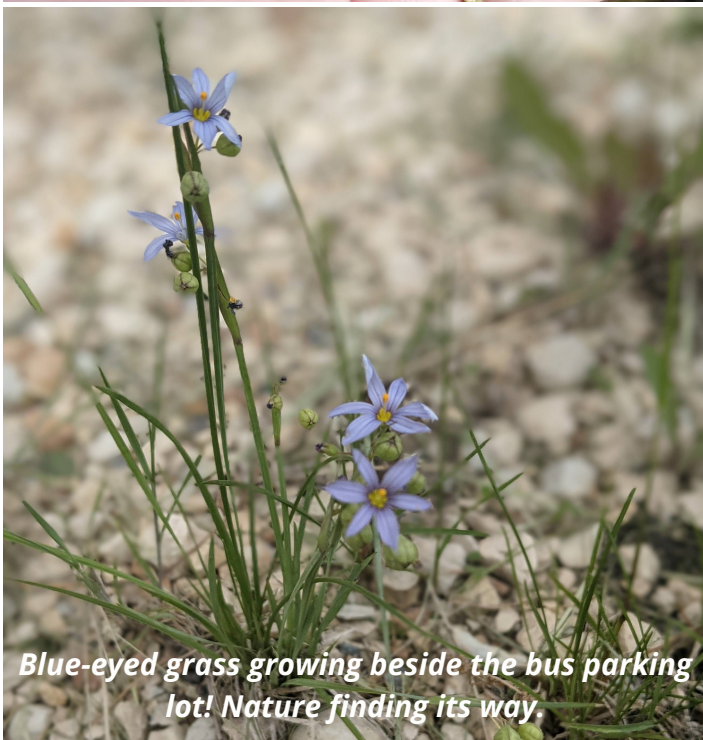
Blue-eyed grass growing beside the bus parking lot! Nature finding its way.