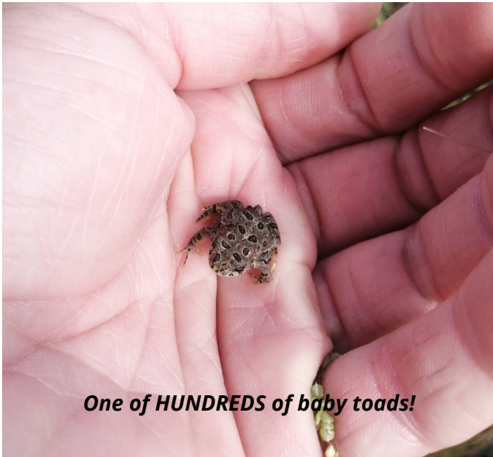
One of HUNDREDS of baby toads!

This spring the land continued to delight us with its surprises of resilience and determination. We found Indigenous plants thriving which we did not plant, or had given up on, many baby birds, jackrabbits, and toads! Seeing these Indigenous plants and animals take root again in this place reminds us that we are working alongside nature to restore what was lost.