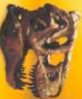
FOSSIL of a Tyrannosaurus rex