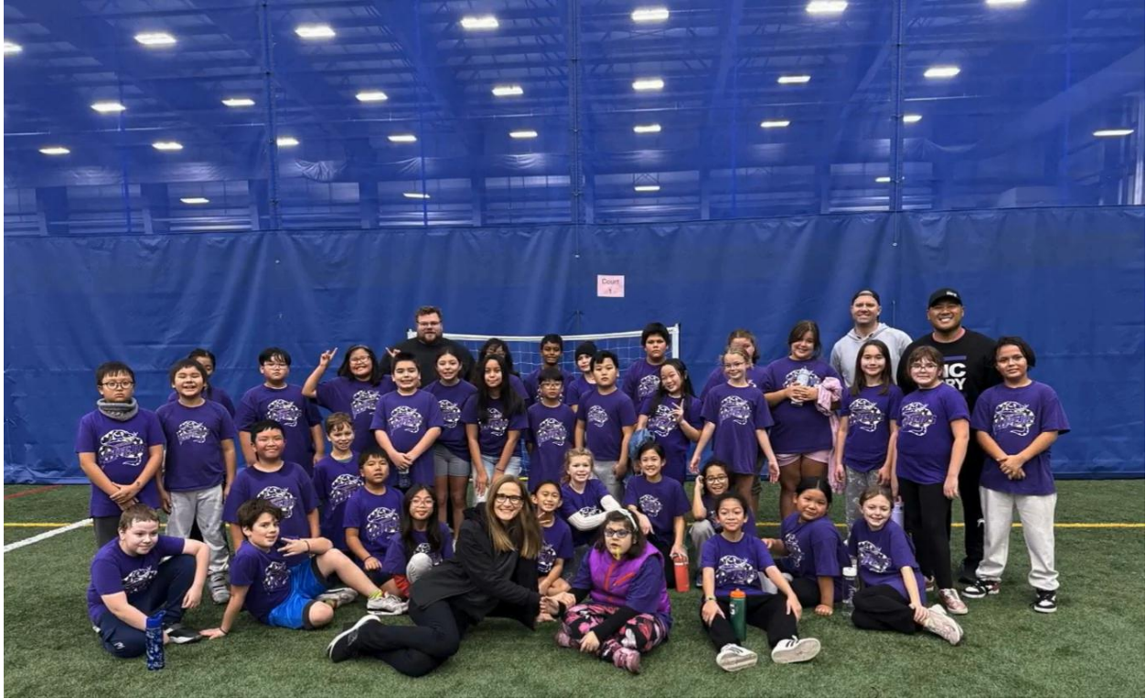
Team Handball & Tennis