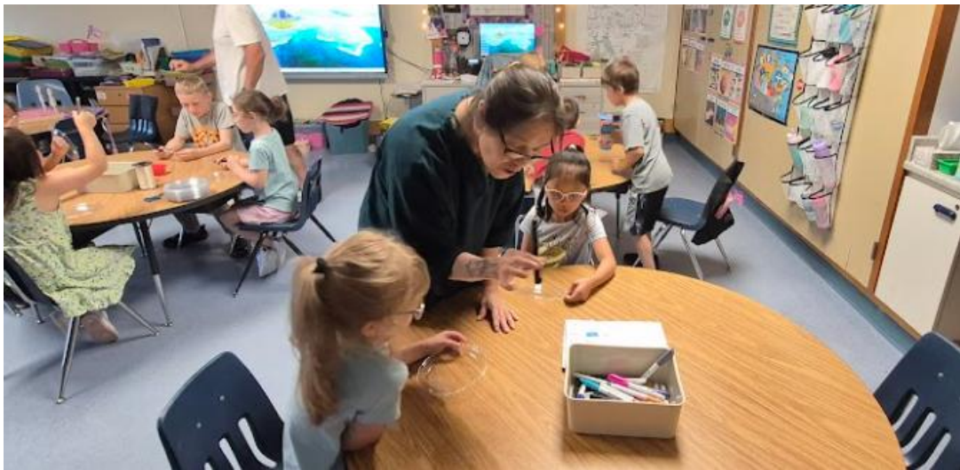
Victory At Play – Summer Edition