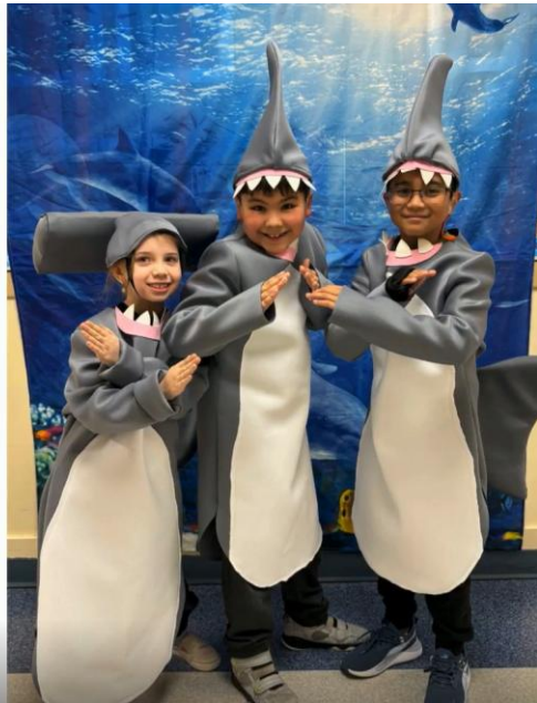
Hip Hop and Tap Clubs