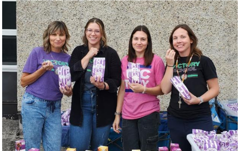
Orange Shirt Day/National Day for Truth & Reconciliation